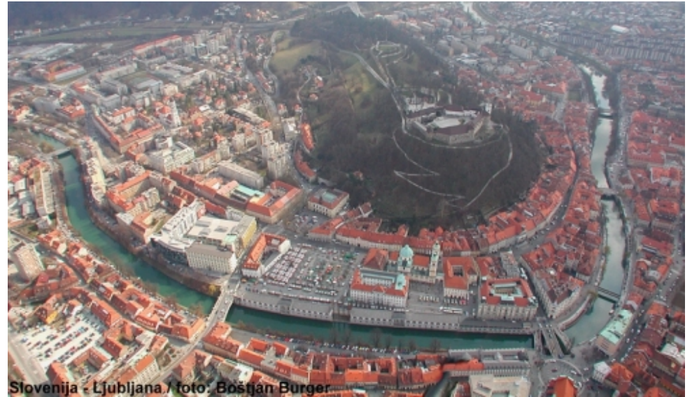
Slovenija - Ljubljana